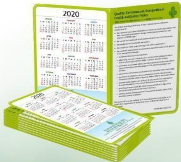
BNPM Objectives Pocket Card